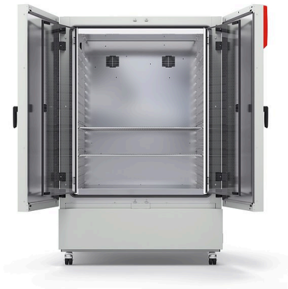
Model KB ECO 1020