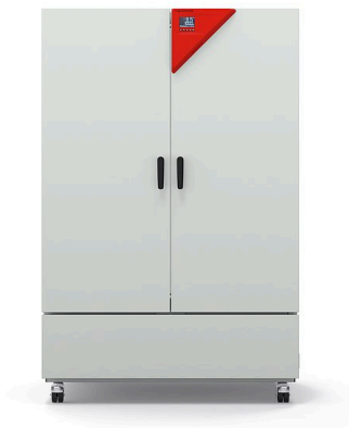
Model KB ECO 1020